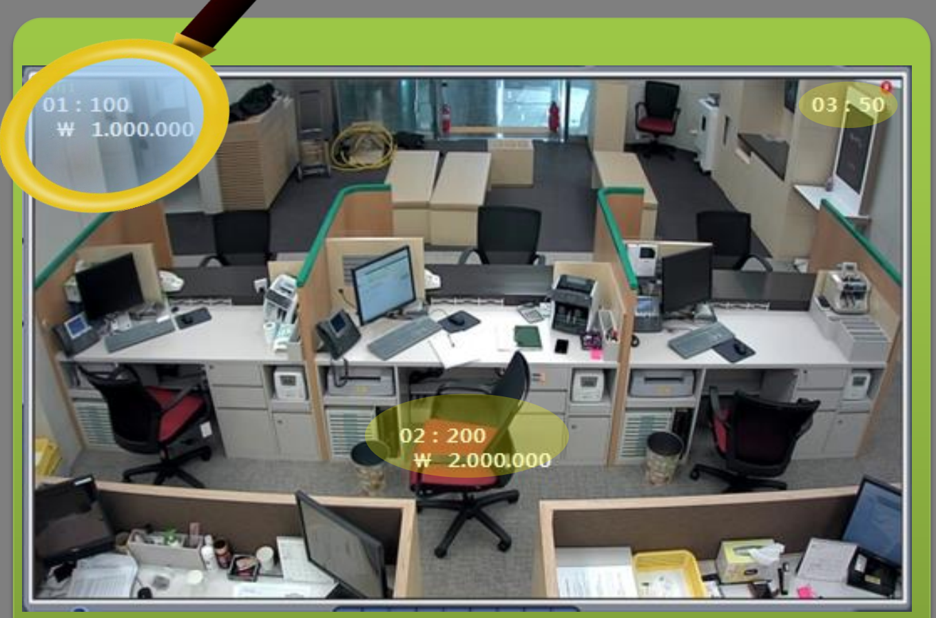
* This image is Hanabank Gang-nam branch recording display

It's only possible to recognize in Counter Recorder.